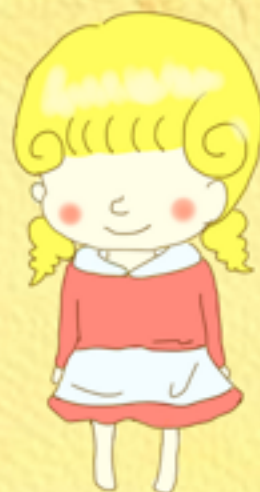
Annie / asRNA

This is a love story of one shy girl called Annie. She was very hesitant, but her passion for him was second to none. One day, Cupid found Annie and helped her. Well, how would the future of her romance going to be?