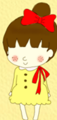
Rachel / ribosome

The most popular boy in the village, but a little indecisive.