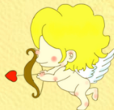
Cupid

The most confident girl in the village. She loves Mike and approaches him positively.